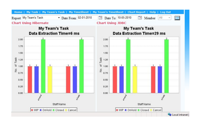
Figure 4 shows the time required for Hibernate as well as JDBC with the same input [4][5]. It can be concluded that the time required for hibernate is much more less as compared to the hibernate.